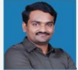
NINGAPPA MENTAL ABILITY