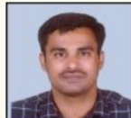
VINAYAK SIR HISTORY