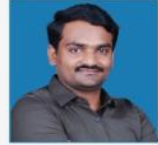
NINGAPPA MENTAL ABILITY