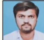
MAMDAPUR SIR PHYSICS