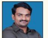
NINGAPPA SIR MENTAL ABILITY