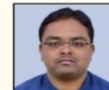
YOGANAND SIR AGRICULTURE