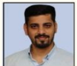
PAJWAL SIR SOCIETY