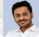
ಧ್ರುವ ಸರ್ ಭೂಗೋಳ ಶಾಸ್ತ್ರ