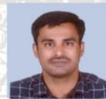
ವಿನಾಯಕ್ ಸರ್ ಇತಿಹಾಸ