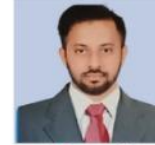
ನವೀನ್ ಸರ್ ಇತಿಹಾಸ