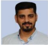
ಪ್ರಜ್ವಲ್ ಸರ್ ಸಮಾಜ