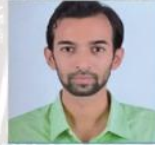
ಶಶಾಂಕ್ ಸರ್ ಭೂಗೋಳ ಶಾಸ್ತ್ರ