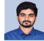
ನಂದನ್ ಸರ್ ಪರಿಸರ ಅಧ್ಯಯನ ಮತ್ತು ಪ್ರಕೃತಿ ವಿದ್ಯಮಾನ