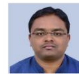
ಯೋಗಾನಂದ ಸರ್ ಕೃಷಿ