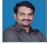
NINGAPPA MENTAL ABILITY