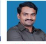
NINGAPPA SIR MENTAL ABILITY