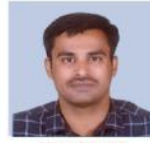
VINAYAK SIR HISTORY