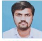
MAMDAPUR SIR PHYSICS