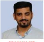
PRAJWAL SIR SOCIETY